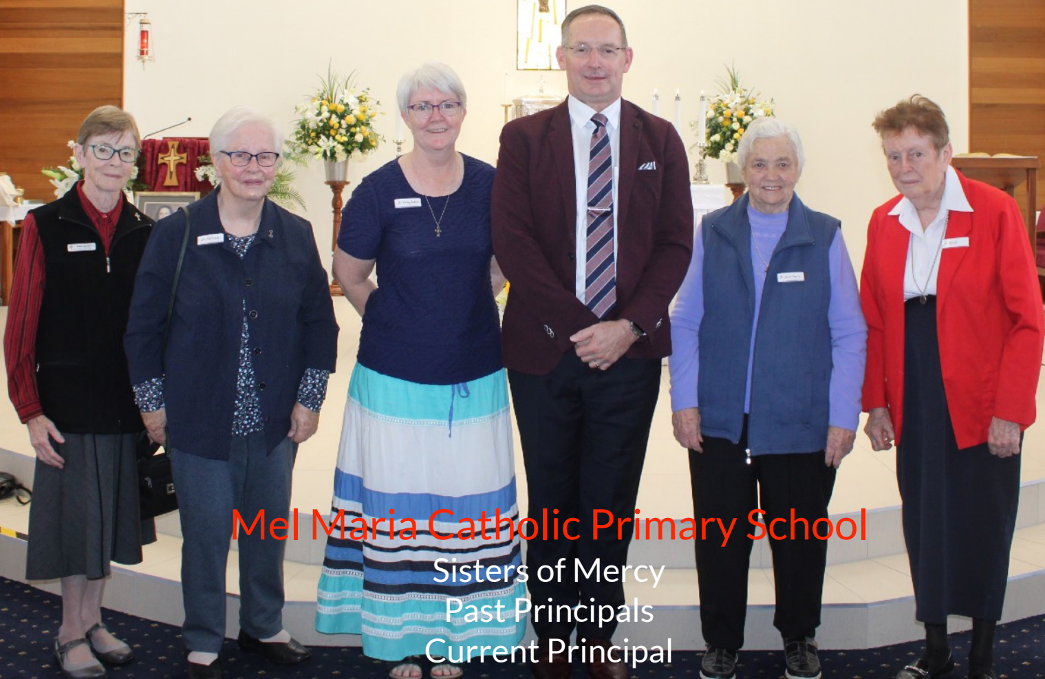
Mel Maria Catholic Primary School Sisters of Mercy Past Principals Current Principal