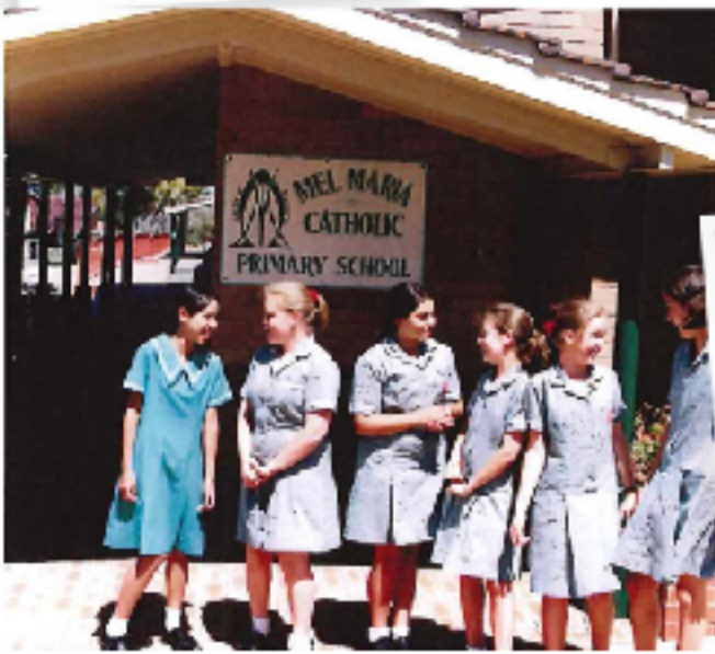
Mel Maria McAuley Campus Yrs 5-7

EXCELLENCE IN CATHOLIC PRIMARY EDUCATION